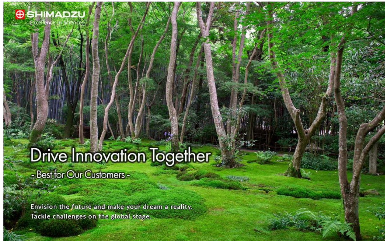
Moss garden at Gioji temple in Kyoto

Analysis of the chemical state, composition, and structure of the surface is very important for the development of new materials or functional improvement of current materials. We know the structural stability and electronic band structure of the multi-layered thin film and the low dimension materials depend on the interface materials. It is important that the evaluation of the next-generation semiconductor materials to achieve the highest performance. The AXIS Supra is a convenient and powerful tool to analyze the chemical bonding, depth distribution, atomic concentration, and electronic band structure (work function, band gap) using non-destructive measurements.